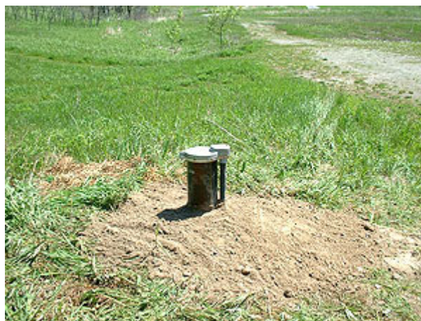
Properly Tagged and Secured Well

The overall results of the inspection sweep indicated that well contractors understand the requirements of the legislation and that their practices generally comply. They also showed that private well owners are properly maintaining their wells.