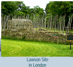
Lawson Site in London

Located at historicplaces.ca , the Register is a searchable database of historic places nominated by federal, provincial, and territorial governments. Use the Register to research your own community's history; learn about other parts of Canada; and locate places to visit on vacation, including places participating in Doors Open Ontario, which runs this year from April to October. Visit doorsopenontario.on.ca for more information.