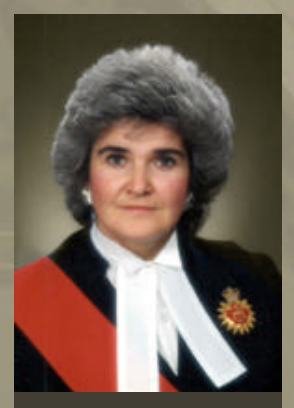
Chief Justice of the Superior Court of Justice The Honourable HEATHER FORSTER SMITH