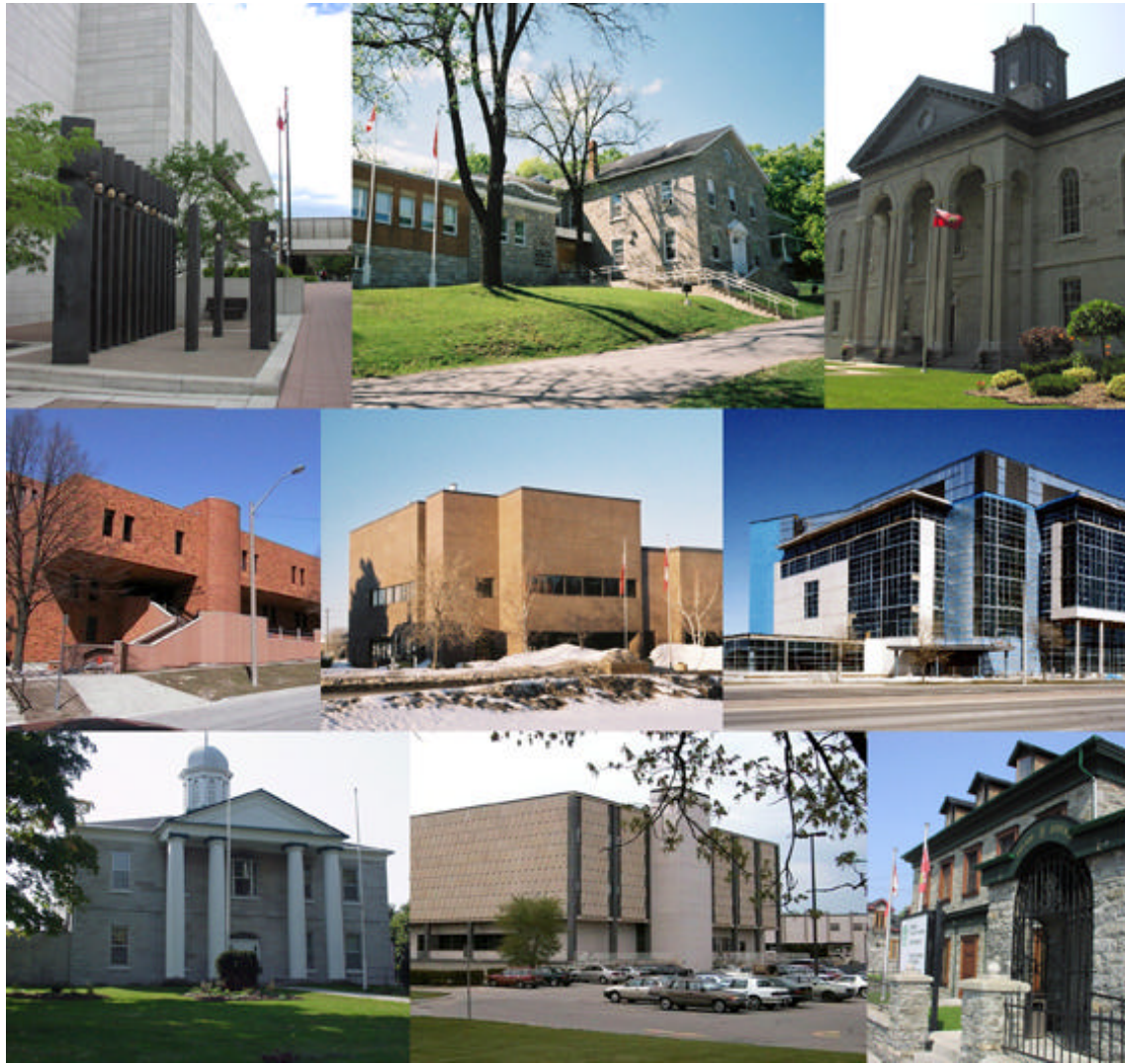
Photo collage of Ontario Courts: (top row) Ottawa, Gore Bay, Napanee; (middle row) Barrie, Thunder Bay, Brampton; (bottom row) Picton, Sarnia, L'Orignal