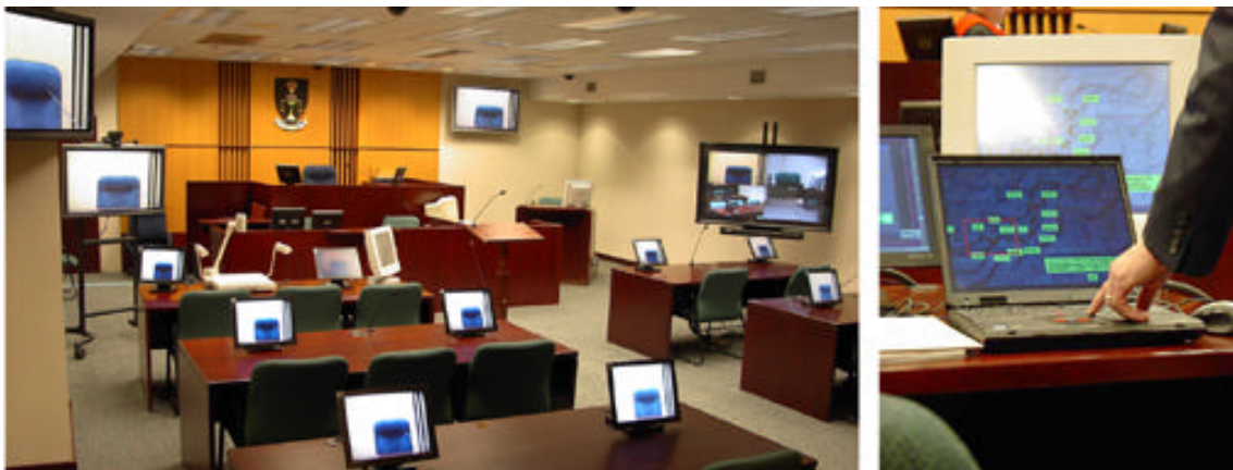
Photos: (left) Model electronic courtroom at 393 University Avenue, Toronto; (right) Electronic evidence presentation by counsel

Display boards will be installed in 18 courthouses across the province, in the cities of Barrie, Brampton, Cornwall, Hamilton, Kitchener, London, Milton, Newmarket, North Bay, Oshawa, Ottawa, Owen Sound, Sarnia, Sault Ste. Marie and Toronto. As of March 31, 2003, development and testing is complete. Implementation is scheduled for spring 2003.