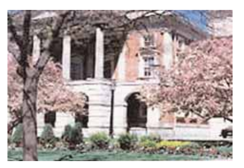
Historic and picturesque Osgoode Hall, where the Court of Appeal for Ontario is located, is where counsel in the office conduct much of our work.

Another significant segment of the trial practice in the office is known as "justice prosecutions" and involves the prosecution of serious offences committed by people involved in the administration of justice, including police officers and lawyers.