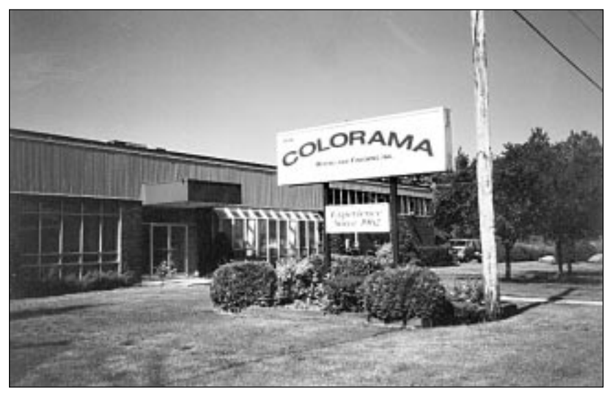
Colorama Dyeing and Finishing plant in Hawkesbury.

The new design included efficient, environmentally sound boilers; increased tankage to hold hot water for reuse and transfer of heat; replacement of dyeing equipment; and the installation of high-speed drying equipment. An integrated tubular finishing line would give the company