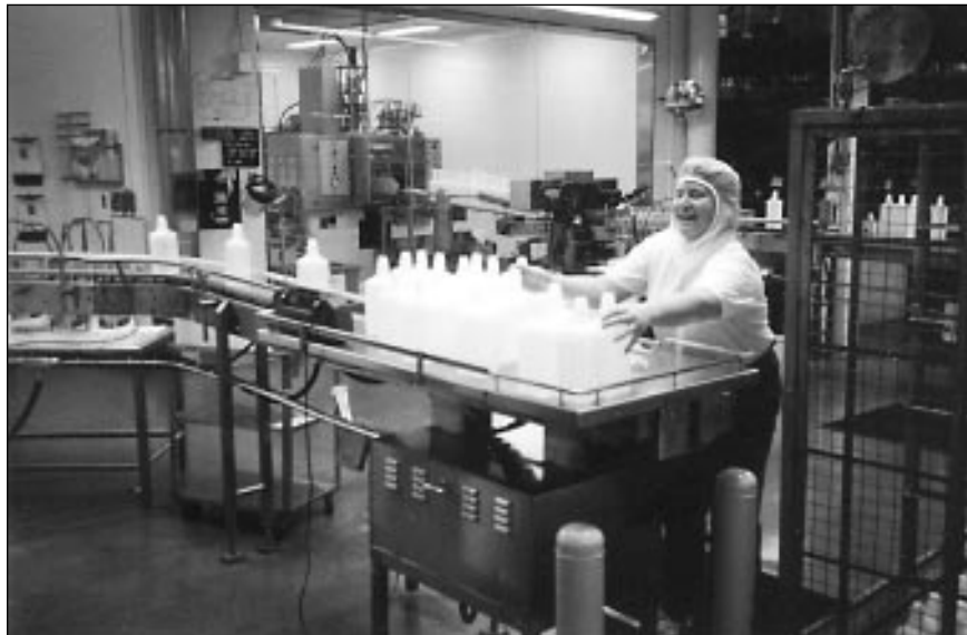
Baxter's Alliston plant manufactures pour bottles for sterile solutions.

into and out of each process, was a major challenge in the environmental and resource analysis. Baxter and the Ministry of Environment and Energy worked together on an environmental and energy analysis of the Alliston plant. The analysis helped Baxter set priorities and plan new "green" projects.