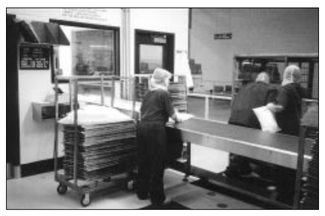
Packaging of intravenous bags.