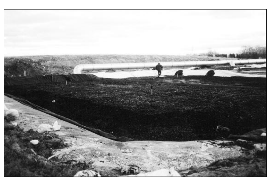
Biological air filters at Maple Lodge Farms have proved to be very effective in eliminating odour.

Equipment and services supply companies can benefit from the information provided on technologies identified for business development.