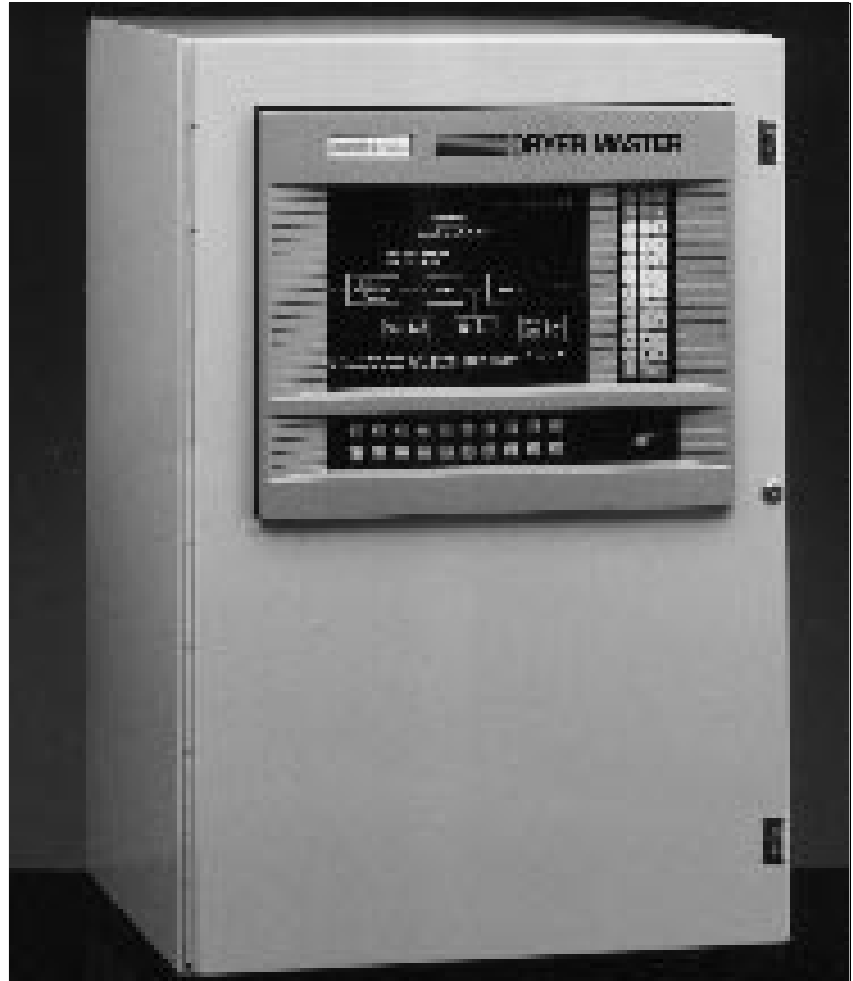
Dantec’s industrial control system for plant-floor applications

Right now, the company is focusing its research and development on increasing the technology’s range so that it can be used for processing natural grains, oil seed meals, pet foods, processed animal feeds, starch and starch by-products, breakfast cereals, processed instant rice, and dried sand and gravel aggregates.