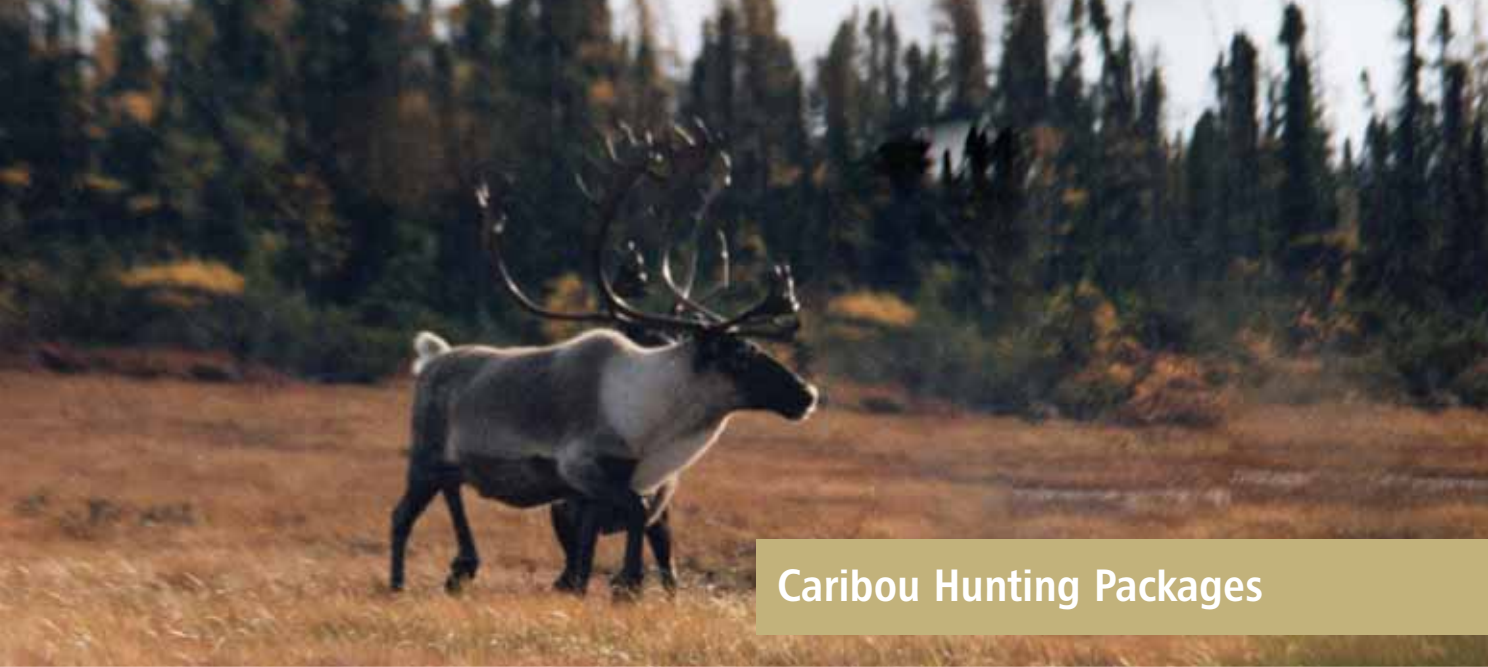
Caribou Hunting Packages