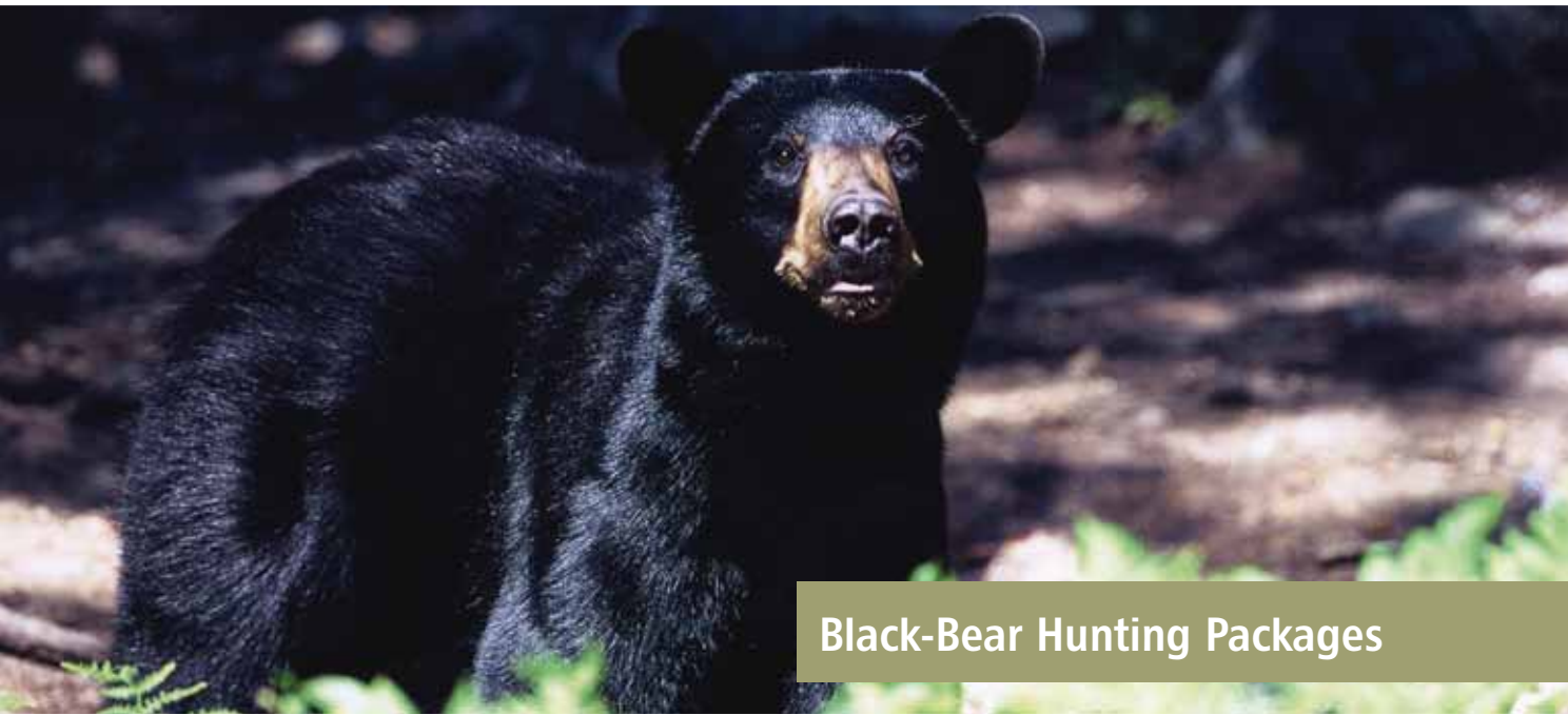
Black-Bear Hunting Packages