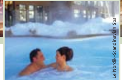
Le Nordik-Scandinavian Spa