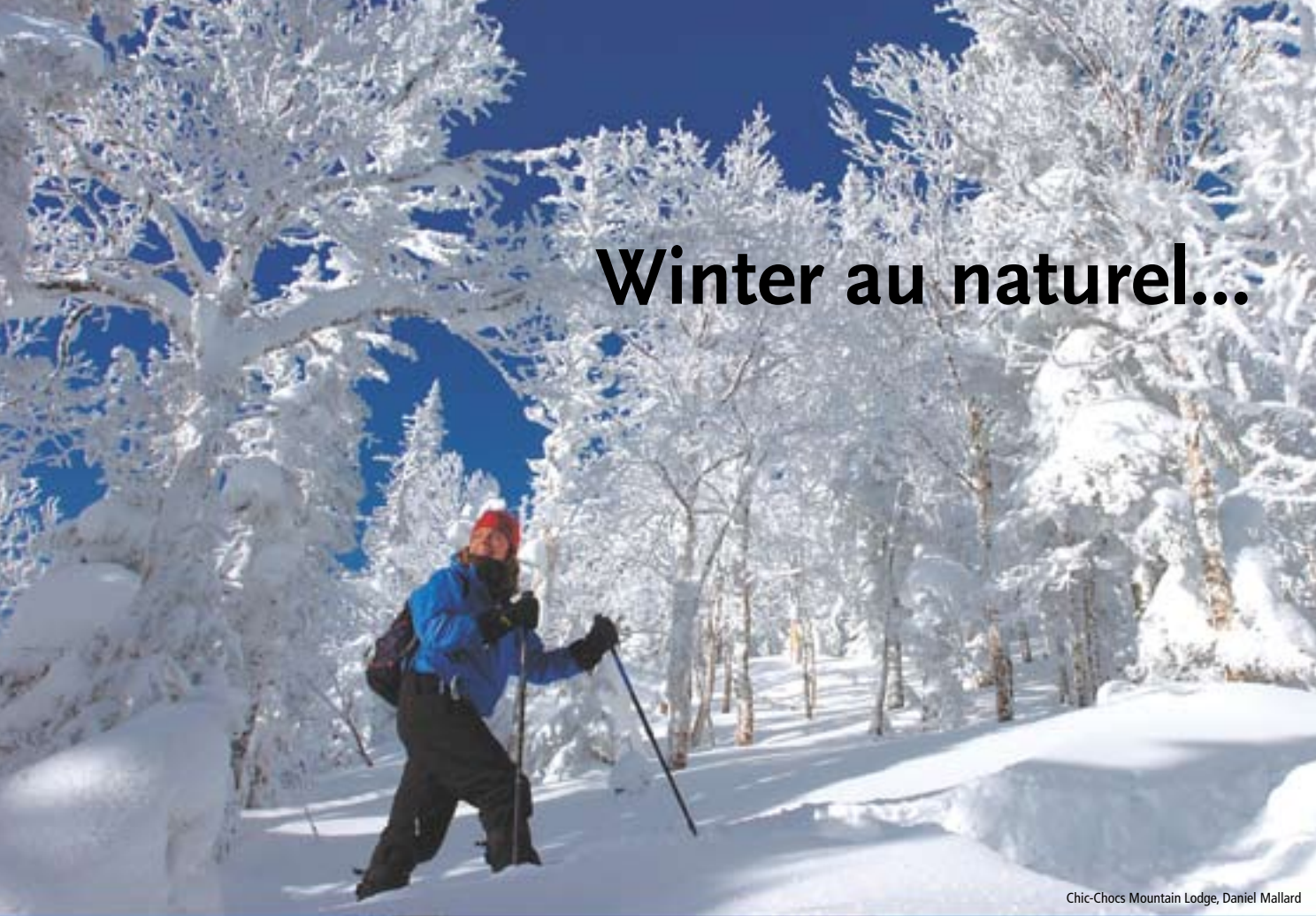
Chic-Chocs Mountain Lodge