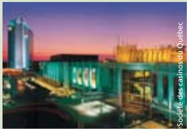
Société des casinos du Québec