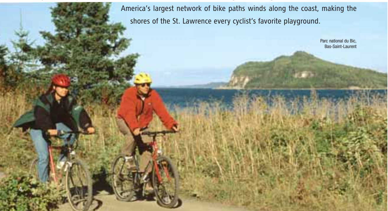
Parc national du Bic, Bas-Saint-Laurent

America’s largest network of bike paths winds along the coast, making the shores of the St. Lawrence every cyclist’s favorite playground.