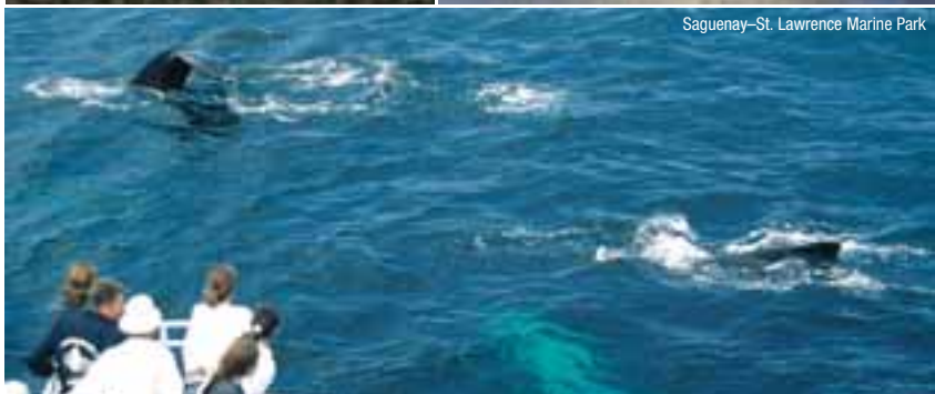
Saguenay-St. Lawrence Marine Park

Sights and sounds that enchant young and old alike.