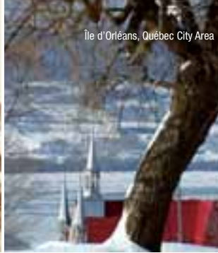
Île d'Orléans, Québec City Area