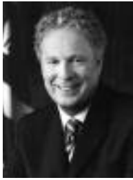
JEAN CHAREST PREMIER OF QUÉBEC

E vents over the past few years have unfolded, from a historical perspective, at an accelerated pace. Countries referred to as third-world have joined the ranks of the global economic powers. The means for transporting goods, merchandise, and people have changed radically. The technological revolution has transformed the way we interact with information, and images now travel as quickly as capital.