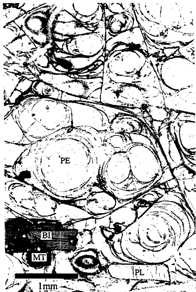
Photo 2. Microphotograph of the perlite showing feldspar phenocrysts in glassy matrix. PE = perlite; PL = plagioclase; BI = biotite; MT = magnetite.

characteristic of most perlites. The rock has very low SO 2 content, minimizing the potential of sulphur release to the atmosphere during processing.