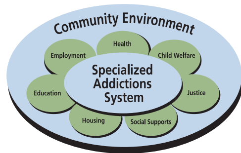
Figure 4 Multi-Layered Service Model