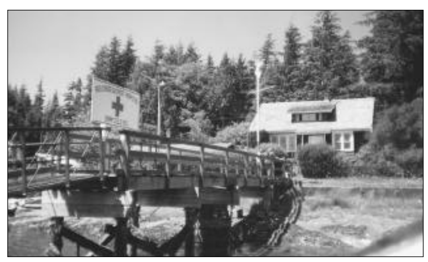
Red Cross Cottage Hospital at Bamfield