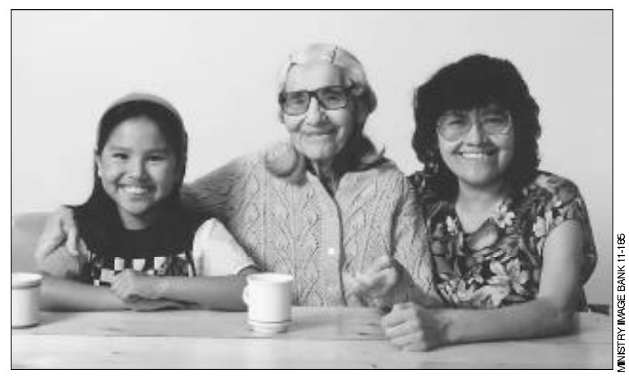
Sharing and appreciating knowledge and experience from one generation to the next is a key component of traditional aboriginal healing.