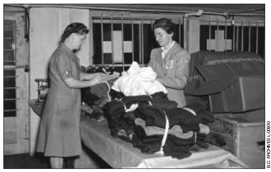
World War II Red Cross Workers