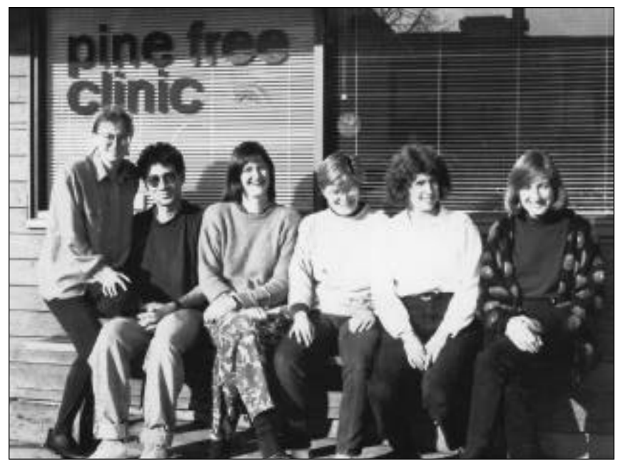
Pine Street Clinic

limited because, although no hospital was required to have a Therapeutic Abortion Committee, this was the only legal route available for terminating an unwanted pregnancy.