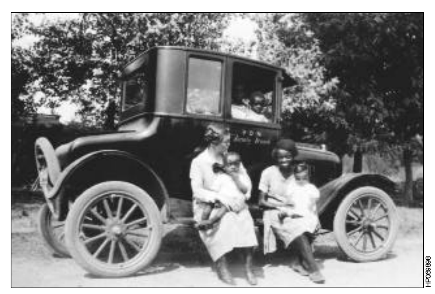
Two VONs sitting on a car's running board with children.