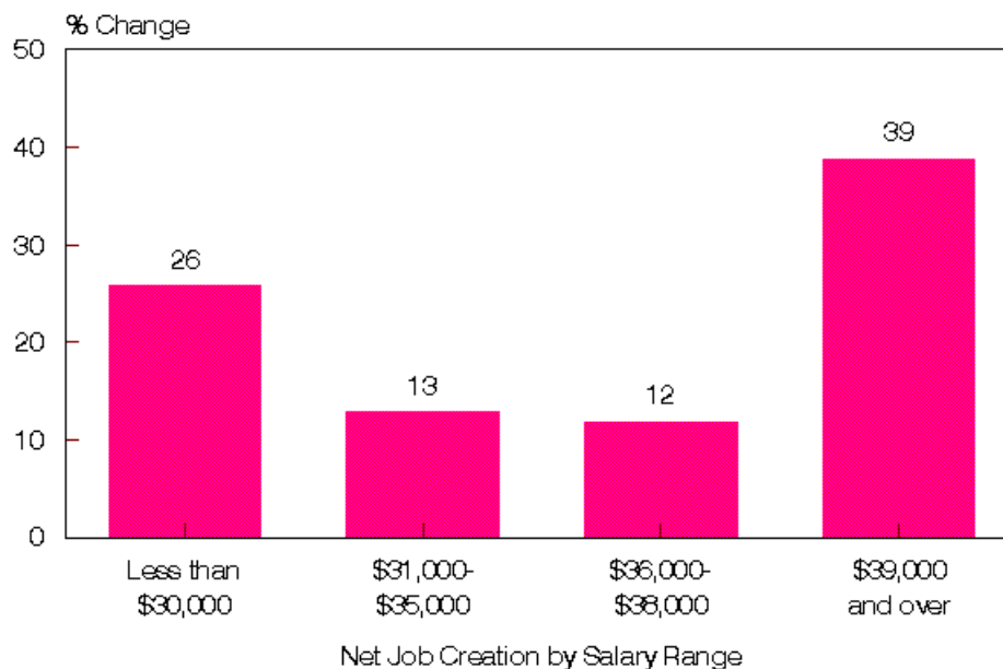
The Declining Middle: Occupations at the top and bottom of the wage scale grew most rapidly between 1980 and 1990