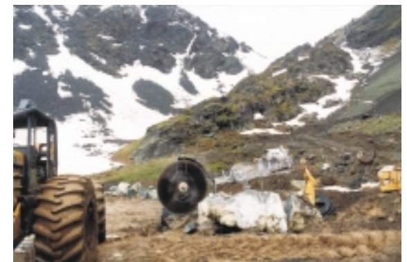
Jade sampling, Cry Lake area

Industrial grade jade has been stockpiled in B.C. in anticipation of serving the growing natural-stone tile market. Jade tiles have great market potential in new, upscale residential and commercial building applications.