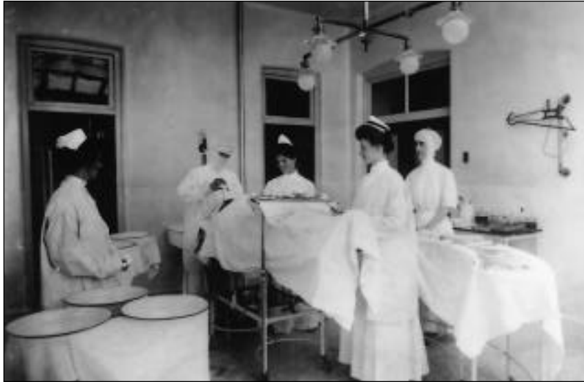
Nurses in operating room at Vancouver General Hospital, prior to 1915.

tents for patients with diphtheria, tuberculosis, scarlet fever and other contagious diseases were set up on the hospital grounds. A marvellous improvement over the original nine-bed tent facility erected in 1886 to treat railway workers, Vancouver General would continue to expand until, in the 1990s, it would become Canada's second largest hospital, boasting four sites and treating 116,000 patients annually. 45