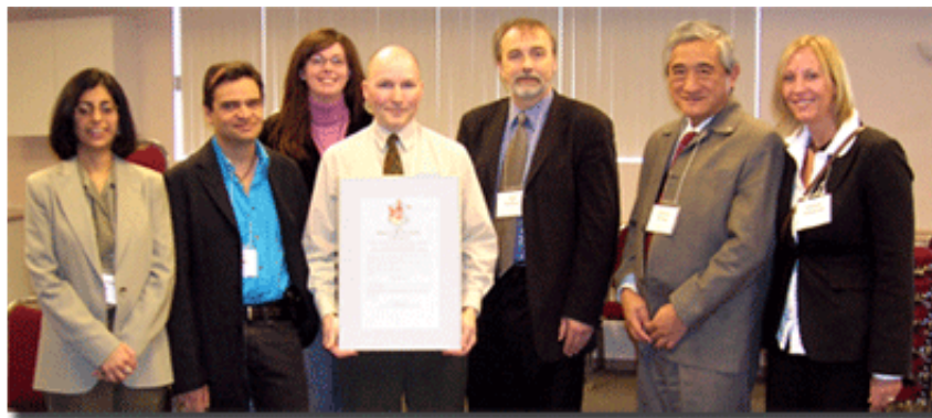
(left to right) Dialogue participants: