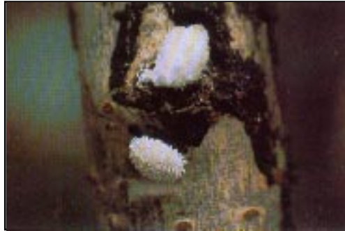
Apple Mealy Bug Adult and Egg Case

Adults are yellow to orange in colour, about 3 mm long, and covered with a granular, white, waxy material. Eggs are yellow and found inside masses of white, cottony wax. Nymphs are oval, flattened and yellow with red eyes. Mature nymphs are about 2.8 mm long.