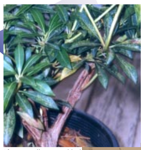
Plate 8. Yellow-speckled damage on foliage.