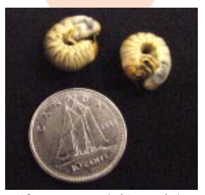
Plate 5. Larvae (white grubs).