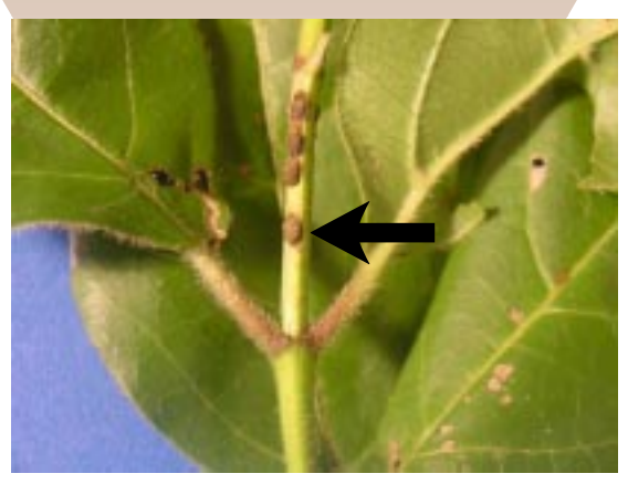
Plate 3. Overwintering egg-laying sites.