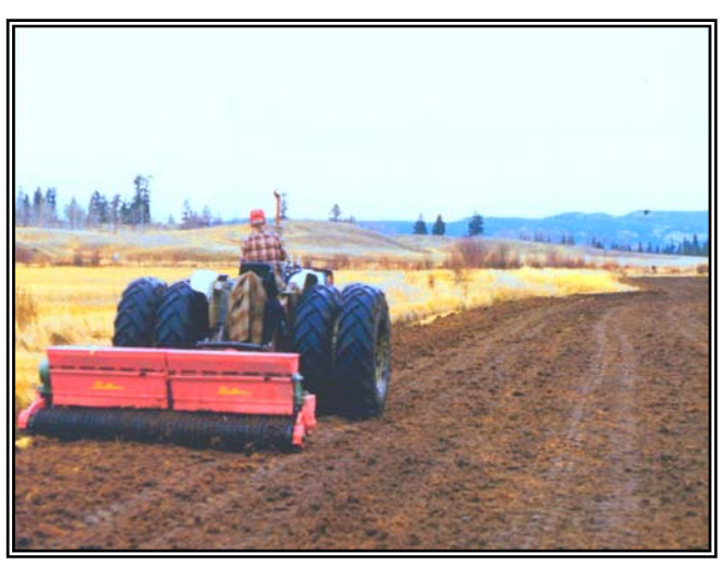
MEADOWS SEEDED TO TAME GRASS

Equipment with large rubber tires, tracks or dual wheels may be required to prevent the machinery from bogging down. Seeding and fertilizing may be done with a conventional drill or broadcast, if followed by light harrowing. Packing is the last very essential operation to firm the seedbed and allow moisture to reach the seedlings. Late fall seedings are successful, providing they are done late enough (after about October 1) so that germination will not occur until the following spring.