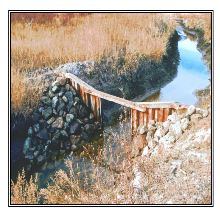
SHEET METAL WATER CONTROL STRUCTURE

Equipment suitable for ditching in wet meadows is available. Many ditching methods have been used in a variety of conditions, however, a low ground pressure excavator on tracks has proven the most efficient in the majority of conditions. Water control is critical to the management of meadows. The Ministry can recommend control structure designs.