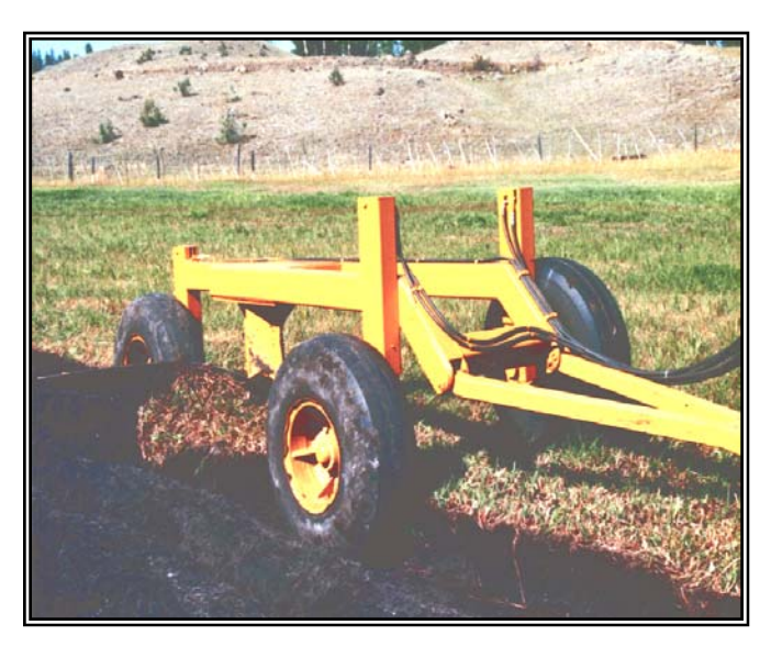
BCMAFF WETLAND BREAKING PLOW

The Resource Management Branch has developed a breaking plow suitable for use on these willow-bound wet meadows. To date, several hundred acres of varied brush, moisture and soil conditions were plowed using the BCMAFF Wetland Breaking Plow with very good results.