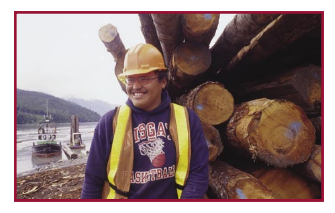
Revenue-sharing agreements are supporting greater Aboriginal participation in B.C.'s number-one industry.