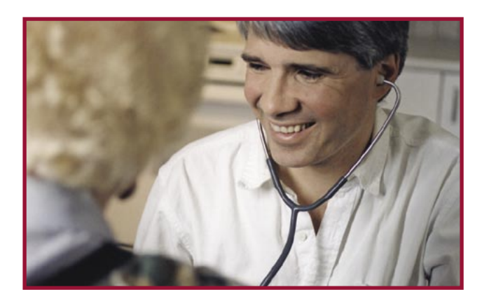
Fair PharmaCare ensures greater fairness and protection for low-income seniors. Fair PharmaCare will curb fast-growing prescription costs while protecting those with low incomes.