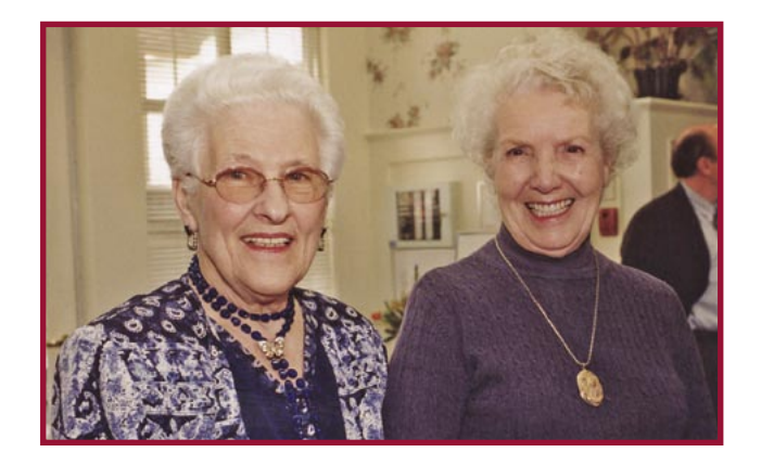
B.C. is opening up new levels of support that better match the care needs of today's seniors.