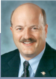
Honourable Pat Bell Minister of Agriculture and Lands