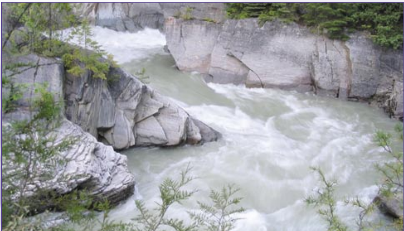
Ground water and surface water are interdependent.