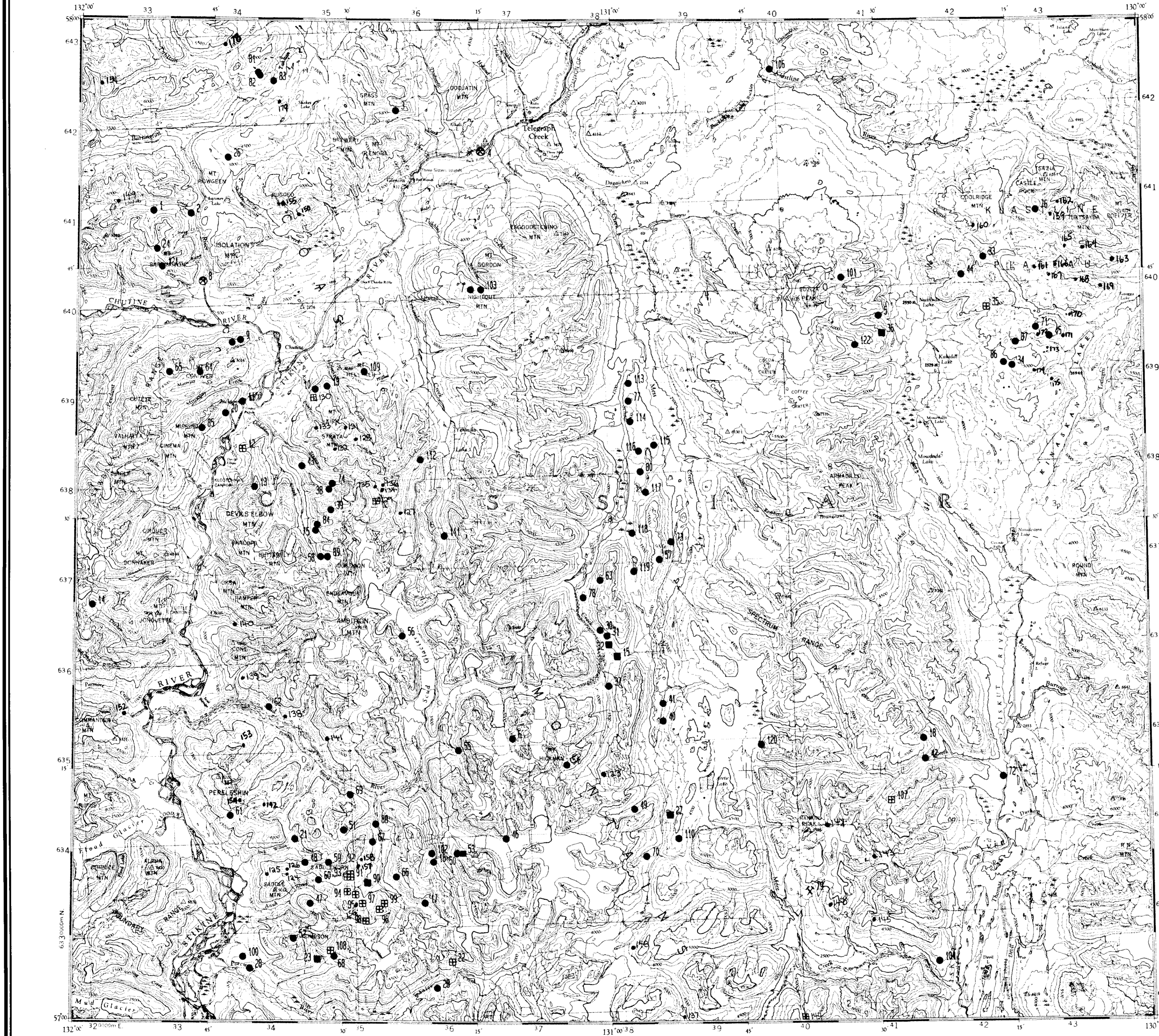
Topographic base map produced by SURVEYS AND MAPPING BRANCH, ENERGY, MINES AND RESOURCES CANADA.