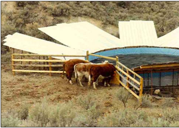
Cattle Drinking from Partially Full Collection Tank