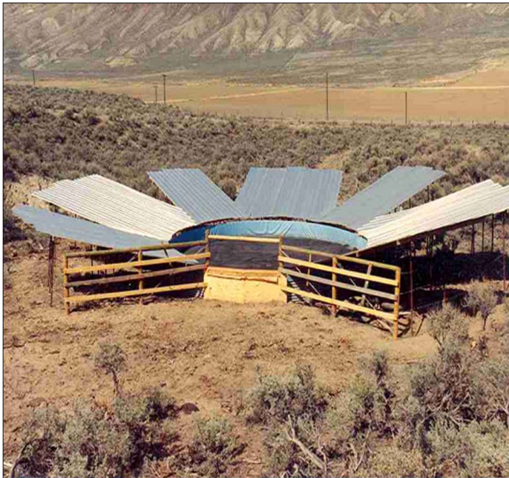
Water Harvester at Cache Creek, BC Showing Vinyl-Lined Tank, Wooden Rail Approaches and Livestock Drinking Access