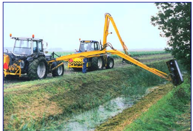
Figure 1 Mowing a Ditch From One Side

Quite often mowing of vegetation above the waterline is required to control blackberries, thistle, tansy ragwort or other noxious weeds.