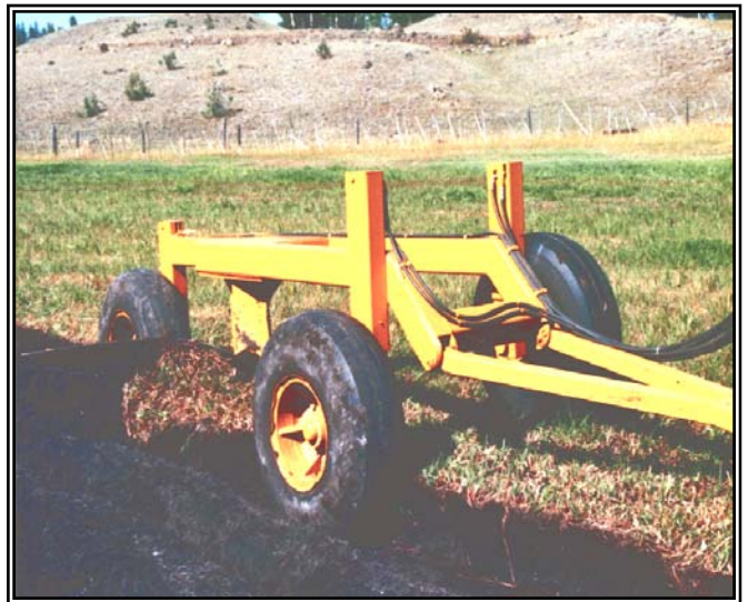
BCMAFF WETLAND BREAKING PLOW

The Resource Management Branch has developed a breaking plow suitable for use on these willow-bound wet meadows. To date, several hundred acres of varied brush, moisture and soil conditions were plowed using the BCMAFF Wetland Breaking Plow with very good results.