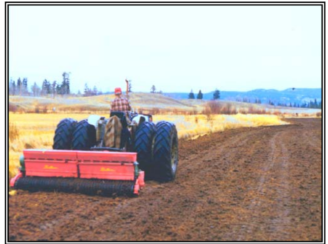
MEADOWS SEED TO TAME GRASS

Discing the plowed meadow is difficult with conventional tractors (rubber wheeled or crawlers) when the meadow is soft. Under these conditions, it may be necessary to use a LGP crawler to pull the disc. The contractor may offer this service at the cost of $40.00 per hour using the rancher's disc to work the meadow plowed by the contractor. Under most conditions, a double pass with the disc is all that is necessary. The discing rate will vary with field conditions and size of the disc, however, the effective field capacity should be approximately 2 ac/hr or more per pass.