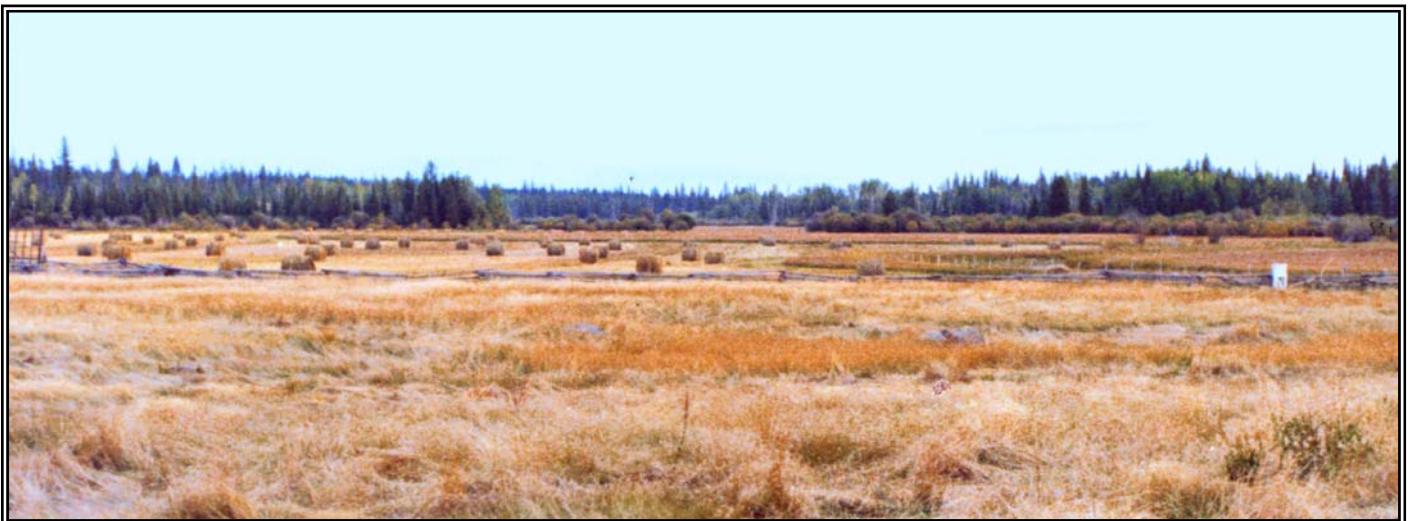
A DEVELOPED MEADOW

To develop organic wetlands, brush control, drainage, water control, tillage, seeding and fertilization are required. Equipment for developing these meadows is now more readily available.