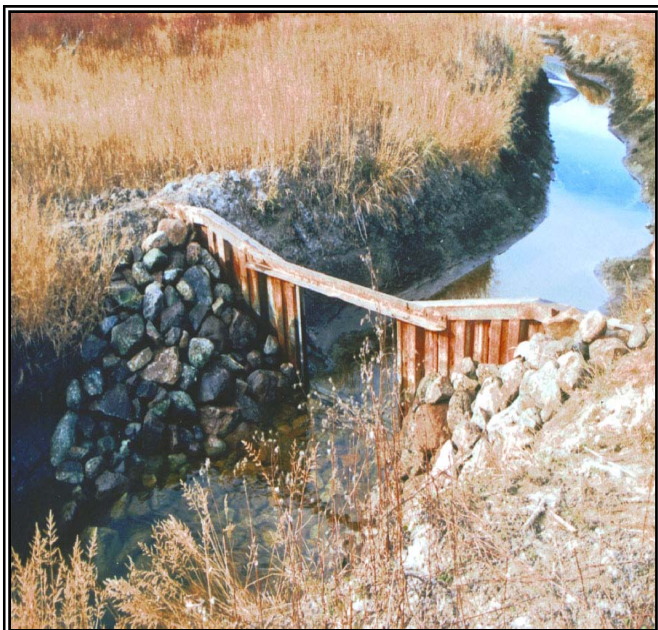
SHEET METAL WATER CONTROL STRUCTURE

Equipment suitable for ditching in wet meadows is available. Many ditching methods have been used in a variety of conditions, however, a low ground pressure excavator on tracks has proven the most efficient in the majority of conditions. Water control is critical to the management of meadows. The Ministry can recommend control structure designs.