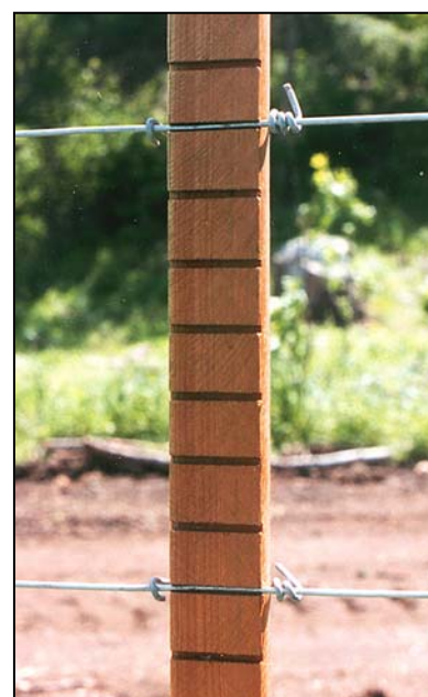
Horizontal slot dropper on htsw

Note that when these slotted wooden droppers are used on moderate or heavy livestock pressure fences they require relatively defect-free hardwood as the slots weaken the dropper. Lower grade woods will require larger cross sectional sizes. Also note that the angled slot designs are made for a specific fence design (number of wires and wire spacings).