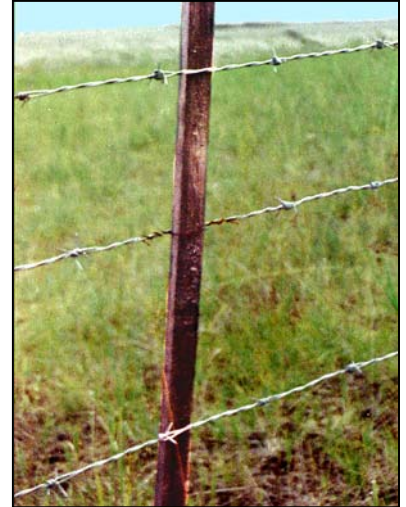
Wooden dropper on barbed wire

The majority of barbed wire fences use wooden droppers, sometimes simply tree branches, etc. available along the fence right-of-way. Because of the surface texture of barbed wire (two twisted strands of wire with frequent barbs) droppers can be simply wire tied (tightly). They seldom slide under livestock pressure when properly tied as shown in the photo at right. Low tensile (soft) wire is used for the tie wire as it is easy to knot. This wire should be galvanized for long life.