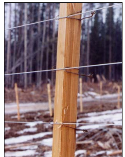
Wire-tied wooden dropper on htsw

Wire-Tied Cedar. While normal or casual tying of wooden droppers to smooth wire is ineffective, this method has been proven to work. Cedar, being soft, is “imprinted” by the wire when tied tightly. Cedar also tends to have little shrinkage as it dries, so the dropper will not loosen. Use cedar with a cross section slightly larger than for other (stronger) wood.