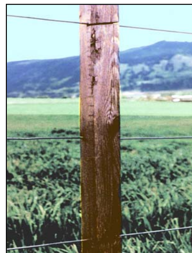
Angled slot dropper on htsw

Angled Slots (on opposite sides). The same material and slot size as the previous dropper but the slots are on opposite sides. This requires the dropper to be woven into the fence wires which improves dropper attachment under livestock pressure. However it also increases wire tension as the “path” of the fence wire is slightly increased. The slots may or may not be cut in alternate directions as the previous dropper. Each dropper may be woven into the fence wires in the same manner or in an alternating manner. Wire tension is greatest when the alternation weave is used.