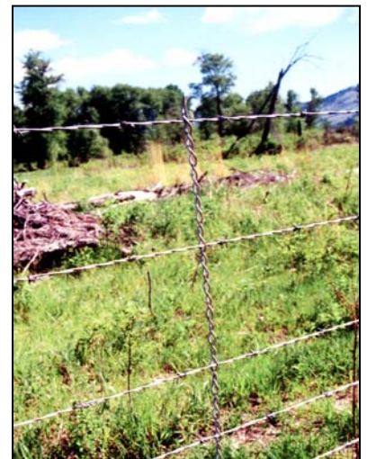
Metal dropper on barbed wire

Twist on wire droppers are used on fences because of the ease of installation and because they are universally adapted to fences (they are made to suit any fence). However they do not have two important dropper requirements; they lack strength (they deform under low livestock pressure and stay deformed) and have low visibility. They are generally not recommended except for low-pressure fences.