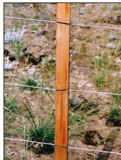
Angled slot dropper on htsw

Angled Slots (all on same side). A dropper of 1 1/2 in. by 1 1/2 in. material has slots cut 10 degrees off horizontal, 1/8 in wide (saw blade width) by 5/16 in. deep. All the slots are on the same side of the dropper (wire tension is not affected by dropper installation). It grips the fence wire due to the angle of the slot. This design, while effective, may be prone to failure if livestock pressure is great enough to force the wire out of the slot. The slots can be cut all in the same direction or the slot angle can be cut in an alternating angle pattern (as shown) for increased retention to the fence wires.