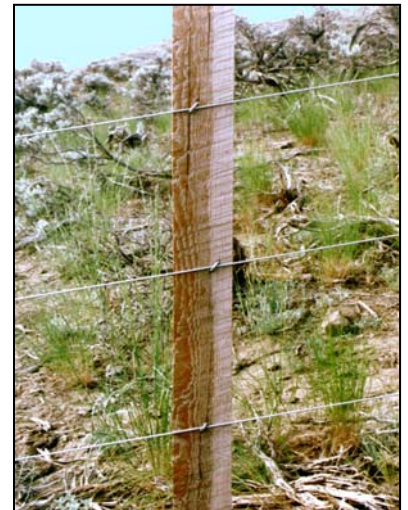
Staple on dropper on htsw

Stapled On. Any of the previous material sizes can be stapled on instead of slotting or wire typing on. This, however, requires seasoned wood (green wood will dry, shrink, and become loose) and usually more effort. If the staple angle is alternated for each fence wire (turned to the left and then to the right - contrary to standard stapling theory) more wire gripping can be achieved. Also the vertical alignment of the staples should be staggered so as to prevent the dropper from rotating under pressure. The staples (use barbed staples?) must be driven “home”. These can be low cost droppers but good attachment is not always possible.