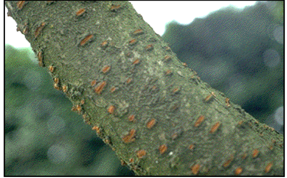
Cherry Bark Tortrix