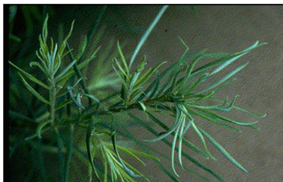
Lygus Bug Damage

Eggs are laid mainly in the stems and on flowers of herbaceous plants, hatching in 1 to 4 weeks. They mate soon after emerging and begin laying eggs immediately, inserting eggs into plant. In mid-summer, a life cycle may be completed in about 25 days, with 2 to 5 generations being completed per year, depending on weather conditions. Lygus populations overwinter as adults in the crowns of plants and plant debris, becoming active with warm spring weather.