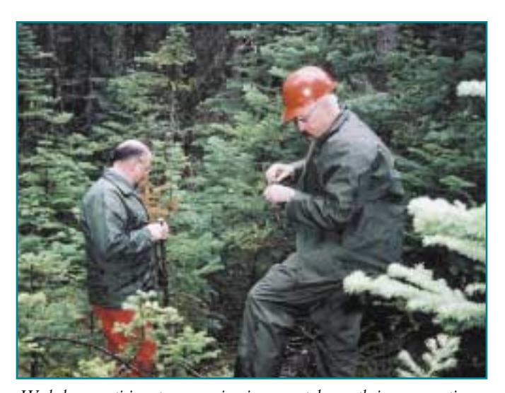
Workshop participants measuring incremental growth in regeneration.

"There were several things I liked about this workshop. The facilitators were able to adapt the workshop to the needs of the audience. They also provided a provincial perspective to some of the local issues being addressed, which I found very helpful. The hands-on portion of the workshop was great."