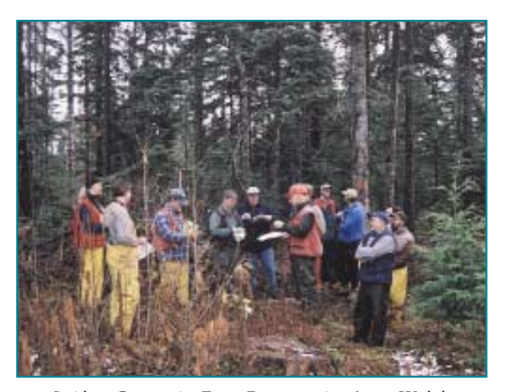
Smithers Community Forest Demonstration Area – Workshop participants discussing the shelterwood system in background.