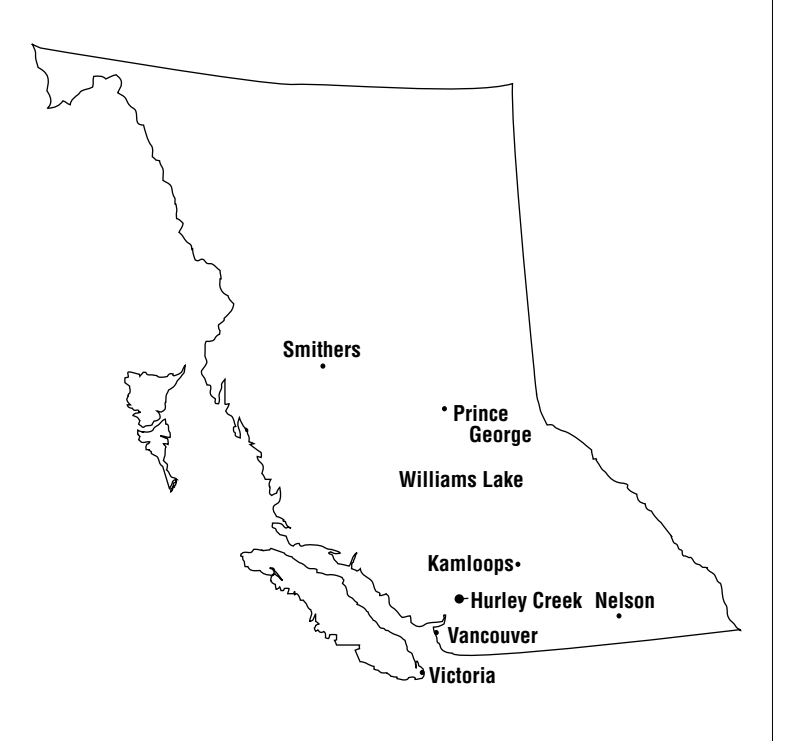
FIGURE 1. Location of Hurley Creek FAS trial.

The Hurley Creek test site is located in the Hope Creek drainage south of Goldbridge in the Lillooet Forest District (Figure 1). The site is in the moist, warm Engelmann Spruce-Subalpine Fir zone (Table 1). FAS was prescribed as a means of minimizing shrubby vegetation competition expected on this site.