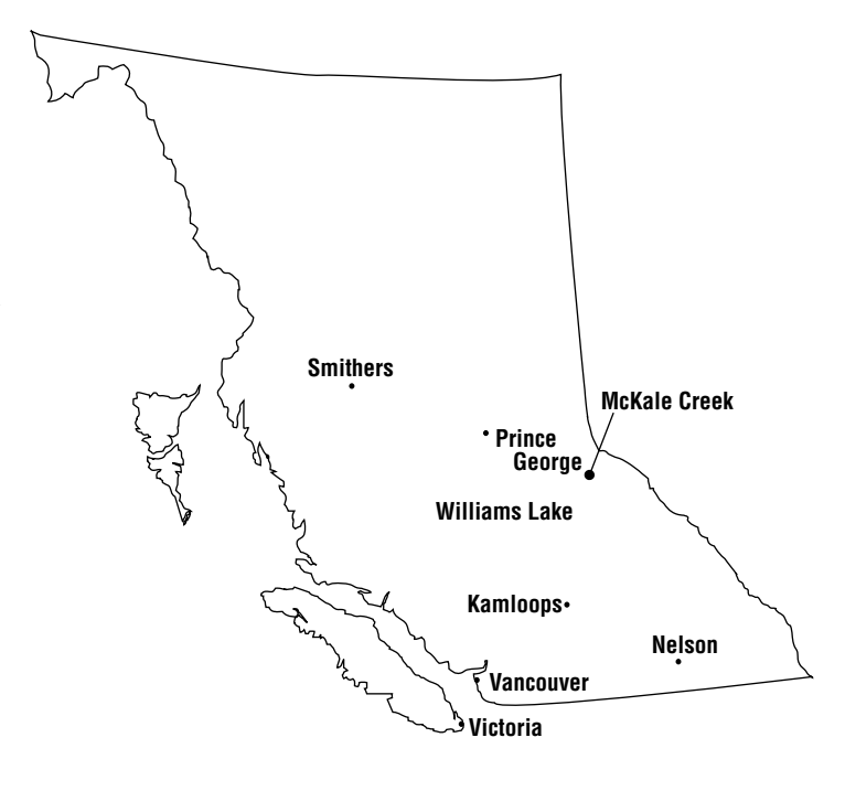
FIGURE 1. Location of McKale Creek FAS trial.

The McKale Creek test site is located south of McBride in the Robson Forest District (Figure 1). The trial is in the very wet, cool Sub-Boreal Spruce biogeoclimatic zone (Table 1). FAS was prescribed for this site as a means of minimizing vegetation competition.