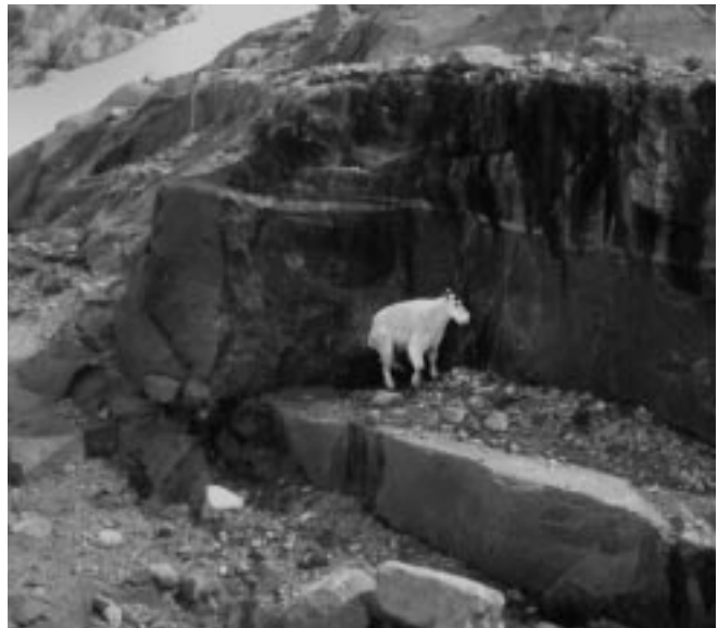
MOUNTAIN GOATS OCCUPY THE MOST RUGGED AND REMOTE HABITATS OF ALL NORTH AMERICAN UNGULATES.

First Nations people, particularly on the coast, have made use of goat products for eons.