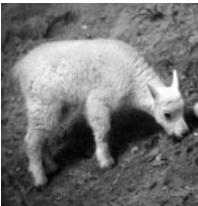
KIDS ARE PRECOCIOUS AND FOLLOW THEIR MOTHER SHORTLY AFTER BIRTH.

Goats can't afford to be choosy about what they eat because their foraging sites tend to be widely dispersed, small in size, and sparsely vegetated. They survive by eating a wide variety of plants, including lichens, ferns, grasses, herbs, shrubs, and deciduous or coniferous trees. No other hoofed animal in North America is so versatile. Goat diets vary considerably from place to place; in dry regions, they eat mostly grasses and in wet areas, woody browse. Their food