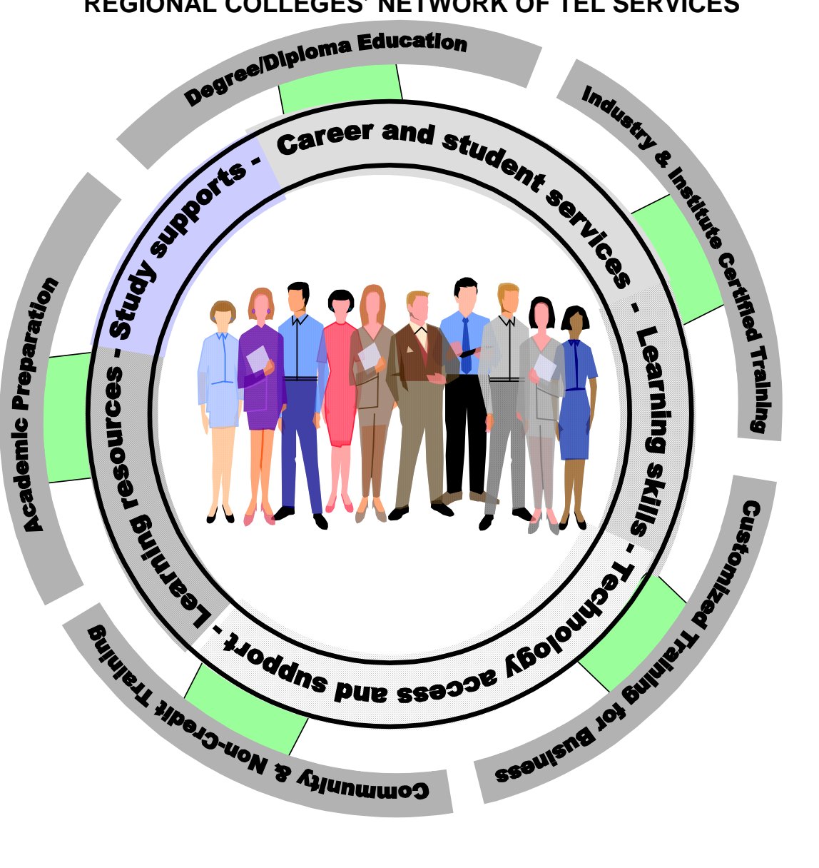
Figure 3: Components of the Regional Colleges' Network of TEL Services

Access to study supports - providing clients with access to study spaces, meeting rooms, mentoring, tutoring, discussion groups, peer support, exam preparation and invigilation.