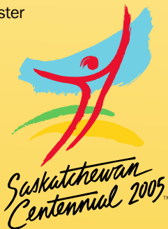
David Forbes Minister

As our province enters its second century, we need to remember that hunting and trapping were an important part of our heritage, that they are part of our present and will continue to be an important part of our future.