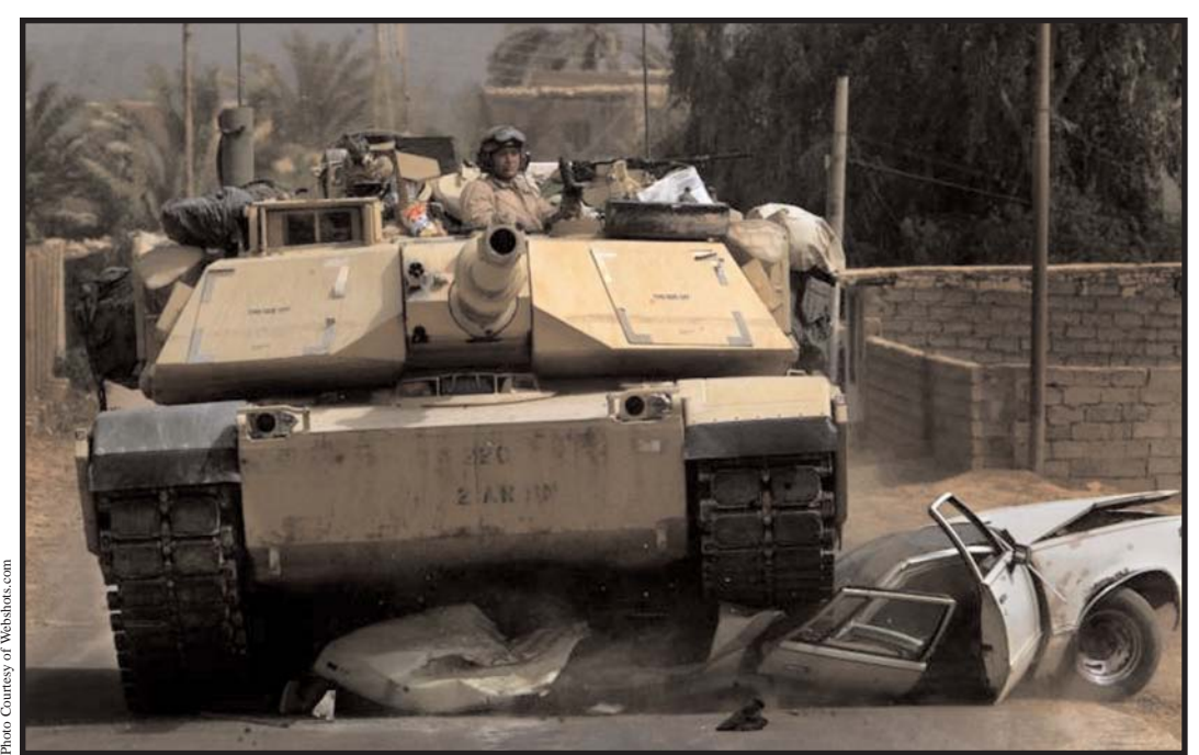
Missile defence is an enabler for US military interventions and regime change campaigns against proliferating rogue states – a vision for US-led "counterproliferation wars" in the 21st century.