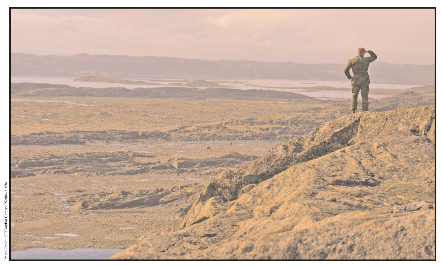
Large areas of Canadian territory is sparsely populated – as shown in this photo, taken during Exercise Narwhal in the Canadian North. This can pose significant security and sovereignty problems.

of the USA, leaving huge areas in the centre of Canada sparsely populated, and its extreme north virtually empty except for a few small installations.