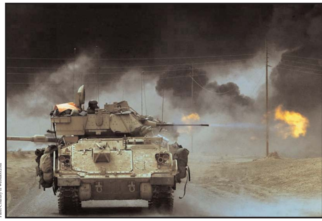
Failing states, as a source of numerous potential global security threats, will represent one of the most complex challenges to face the international community in the 21st century.

with incentives (international aid). Typically, this plays out through the adjustment programmes - a set of agreed policy reforms – established for a given country, together with the main multilateral development institutions, the International Monetary Fund (IMF) and World Bank. Failure can be counted in the many such programmes involving the weakest and most poorly governed states in the world where minimally acceptable performance cannot be established, leading to the breakdown or temporary suspension of engagement. Without the positive endorsement of a regular IMF lending programme, generally a poverty reduction and growth facility (PRGF), aid from western governments and other agencies is generally unavailable except