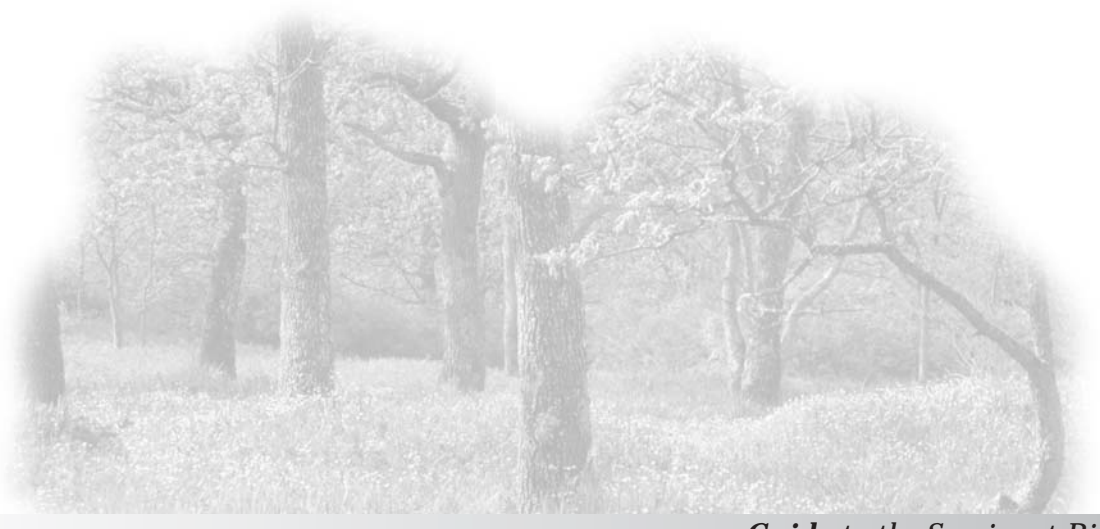
Guide to the Species at Risk Act