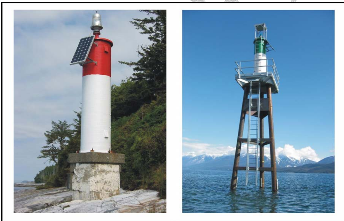
Figure 1: Typical concrete-based and pile-based RCSR structures

Figure 1 shows examples of pile- and concrete-based Fixed Aids that meet the above criteria.