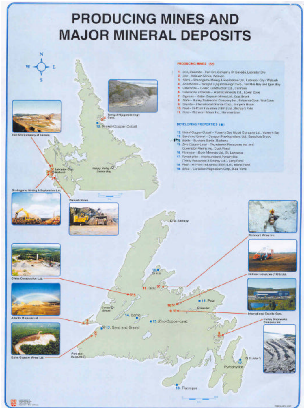
FIGURE 1: Map showing the location of the T.U.C. Ten Mile Bay and Igiak Bay anorthosite quarries near Nain, Labrador, the International Granite Corp. gabbro quarries at Jumpers Brook, central NL and the Hurley Slateworks Co. Ltd. quarry in eastern NL.