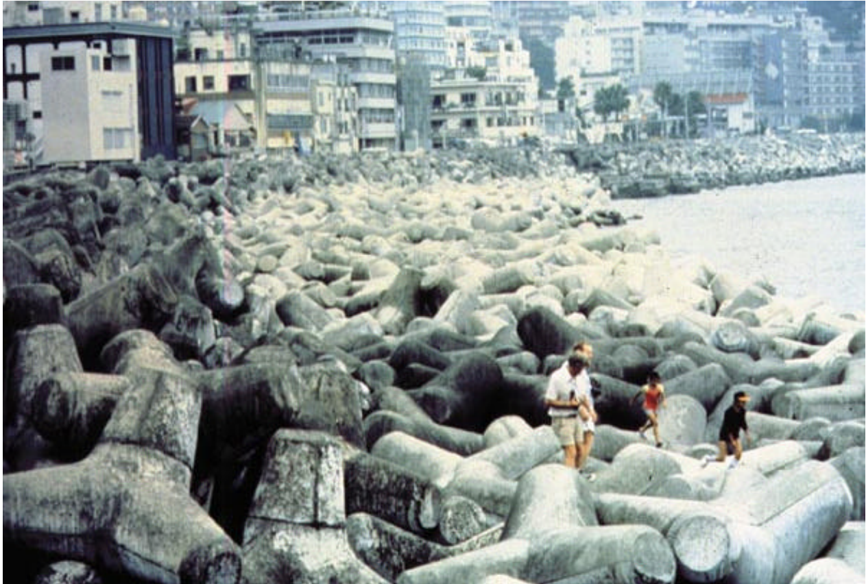
PLATE 2: Multi-legged, massive concrete shore protection armour stone units fronting a resort in Japan.

weigh in the range of 10 to 20 tonnes, although smaller ones are certainly being tested. Initial tests on the large structures have shown that they do not rock in strong wave action, and just a single layer of these Core-Loc pieces can sufficiently armour the underlying breakwater to protect it from erosion. This single layer concept is touted as a major cost savings over other concrete structures.