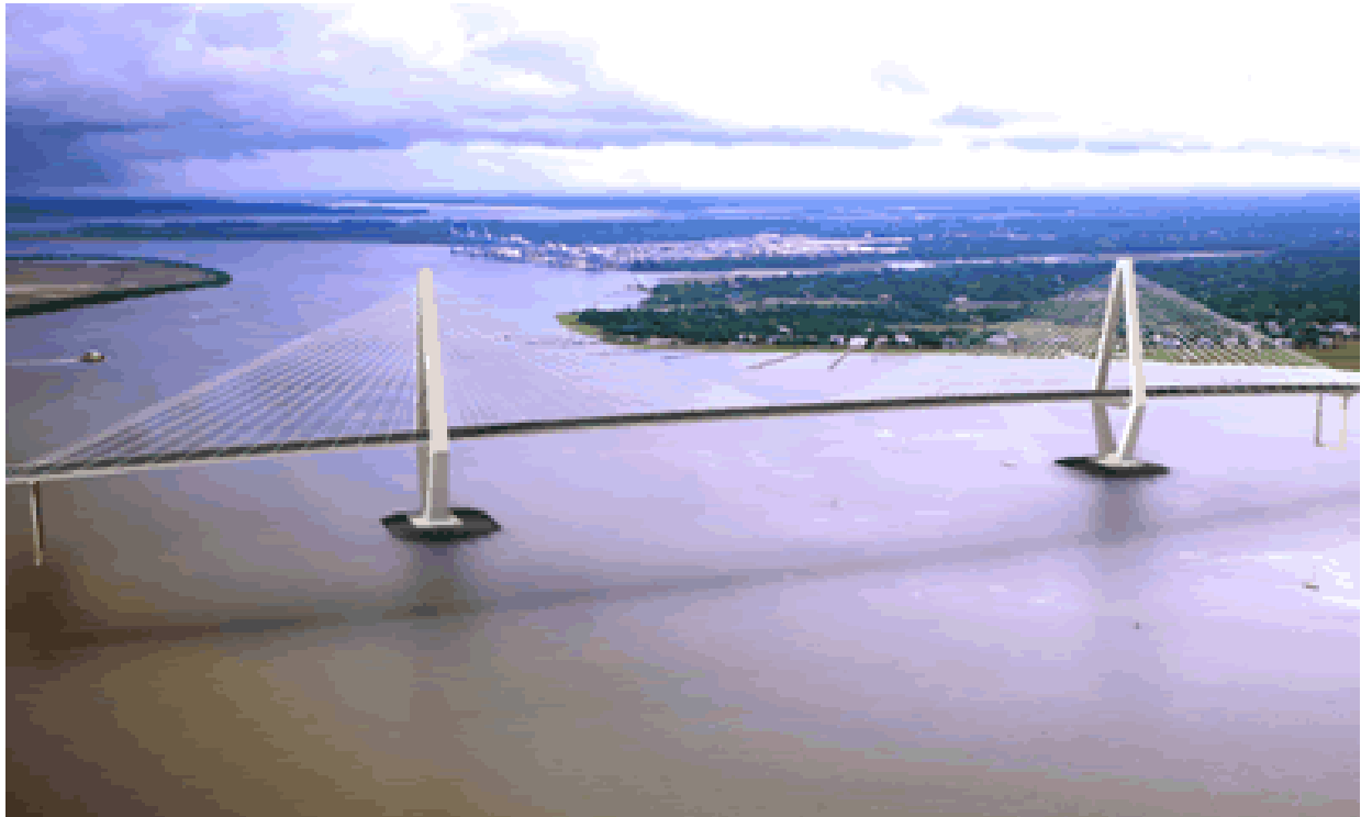
PLATE 1: The Cooper River Project in Charleston, South Carolina, USA showing the two rock islands composed of armour stone supplied by Atlantic Minerals Inc. which are designed to protect the bridge support towers.