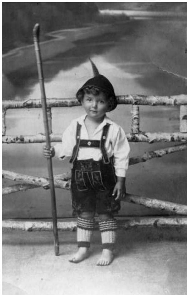
István Anhalt, Budapest, 1921.