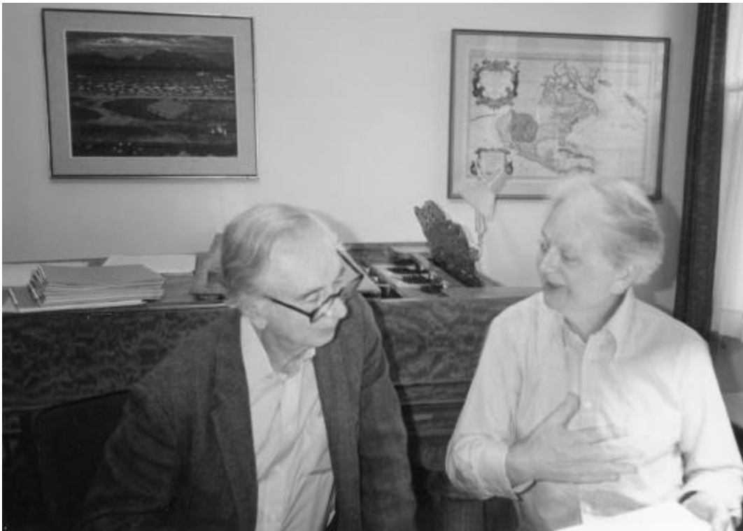
István Anhalt and George Rochberg, 1985.