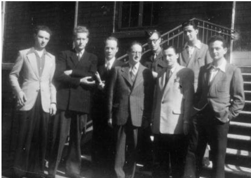
Orchestral conducting class of Louis Fourestier au Conservatoire national de musique et d'art dramatique de Paris, [ca. 1947].