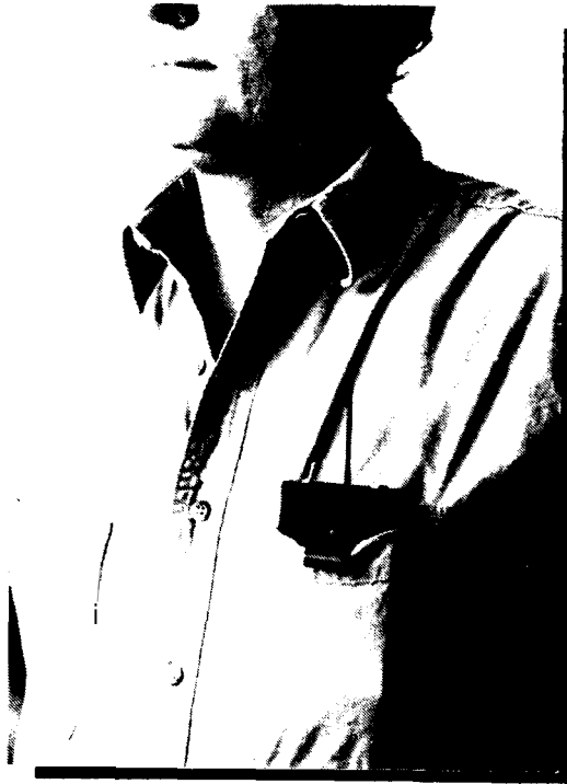
Picture 1 - CYCLOP black and white camera version in shirt pocket