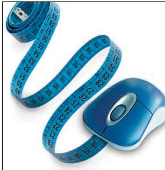
Canadian students will meet in cyberspace to discuss body image issues.

The VirtualClassroom program has been providing distance learning technologies to students within Canada and around the world for over 10 years. The program uses high-speed (10 MB to 1 GB) fibre optic and bidirectional satellite connections (500 kb to 1 MB) as well as broadband visual communication tools to create rich media-interactive learning environments.