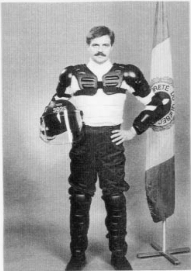
protective equipment worn under the suit