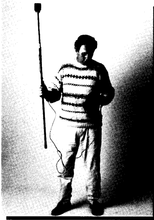
Picture 1 - NOOKLOOKER in the six foot mode with hand held monitor configuration (2 hours operation)