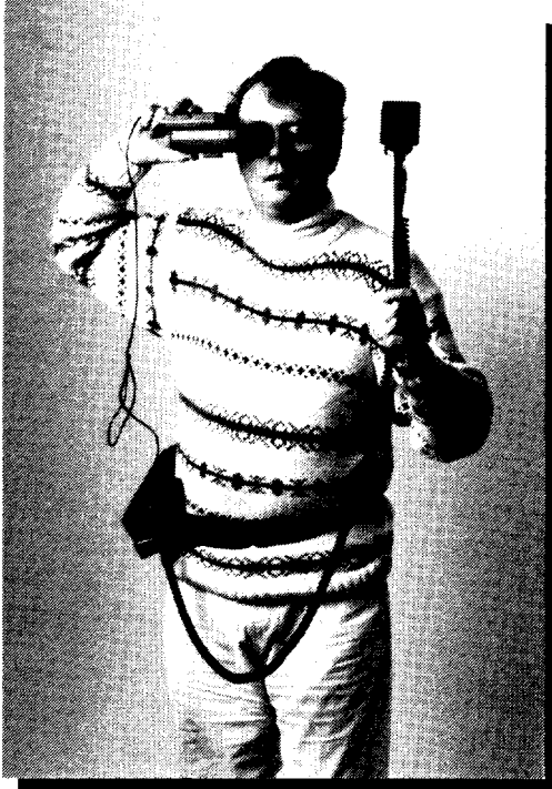
Picture 3 - NOOKLOOKER in the eye piece configuration (6 hours operation)