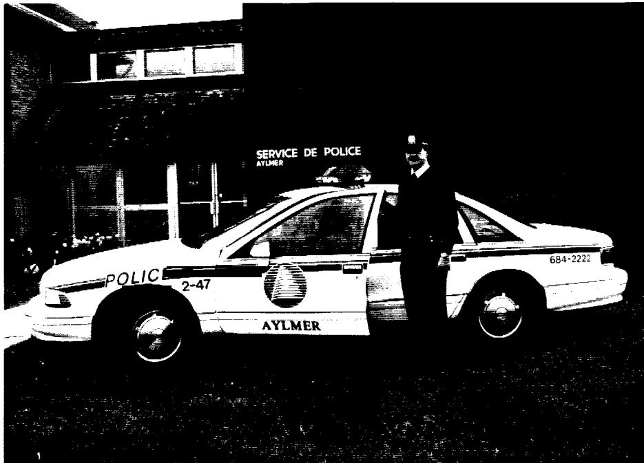
Photograph 1 - Gore-Tex lined sweater